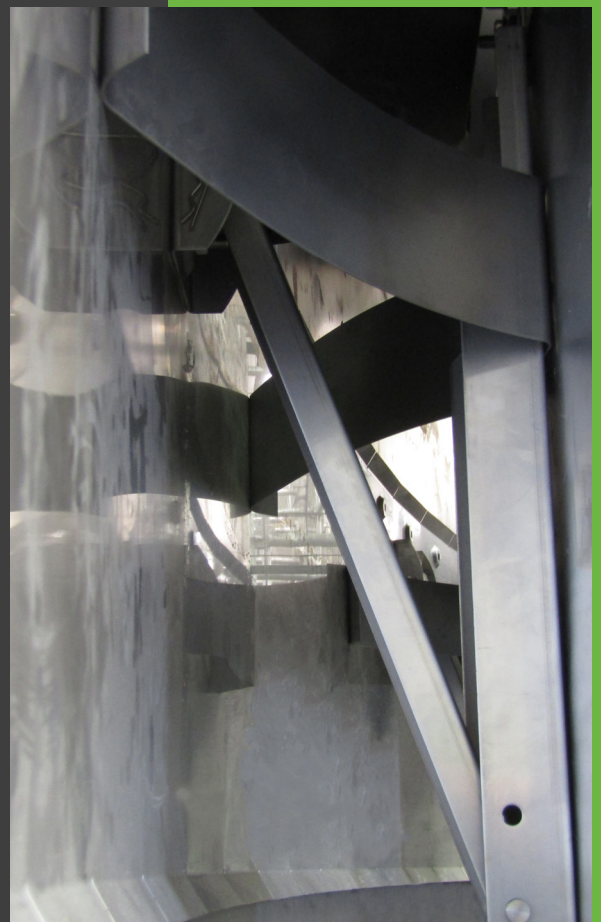
Inner Shoe Primary Mechanical Shoe Seal

For more information, contact our expert team at 713-673-7701 (Toll Free 800-720-6629) or email sales@directtank.com .